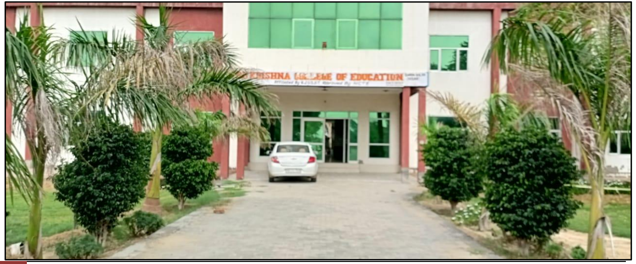
PROSPECTUS (2024-25) FOR ADMISSION TO B.ED- 2 YEARS AND B.A. B.Ed.-4 YEARS (REGULAR) PROGRAMMS OF AFFILIATED COLLEGES OF EDUCATION