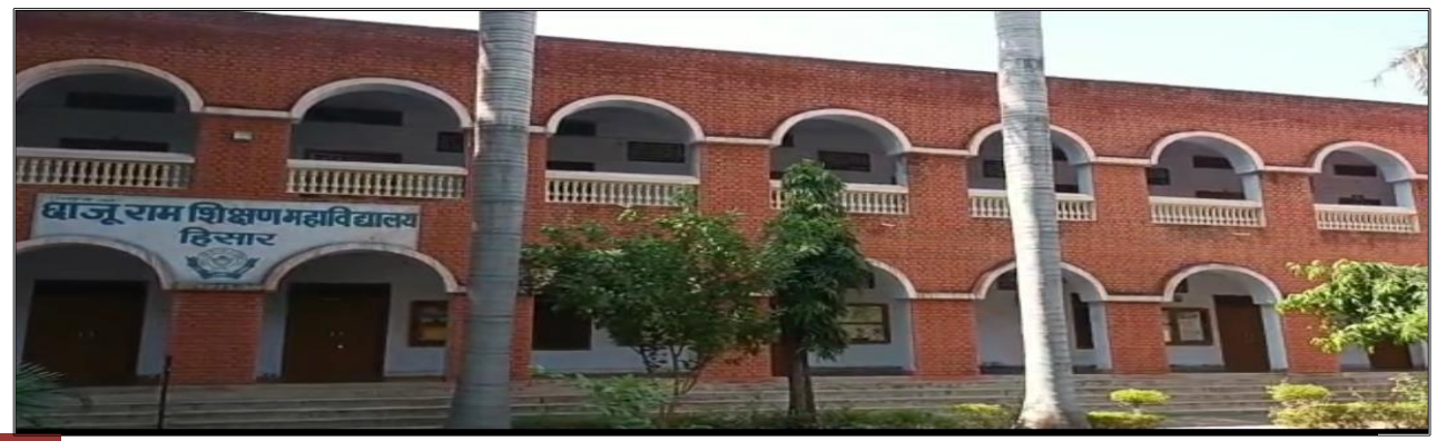
2 PROSPECTUS (2024-25) FOR ADMISSION TO B.ED- 2 YEARS AND B.A. B.Ed.-4 YEARS (REGULAR) PROGRAMMS OF AFFILIATED COLLEGES OF EDUCATION

The campus of the college is sprawled in about 18 acres of land with lush green area. It has serene and natural surrounding. It is well connected through buses, autos and own vehicles. The campus is equipped with good class rooms, library, a multi-purpose hall, laboratories, gymnasium and excellent sports facilities. The college has an excellent learning environment which exposes the students to curricular, co-curricular, internship and outreach programs. It offers plenty of opportunities to students to showcase their potential through participatory programmes such as talent search, literary competitions, games and sports etc.